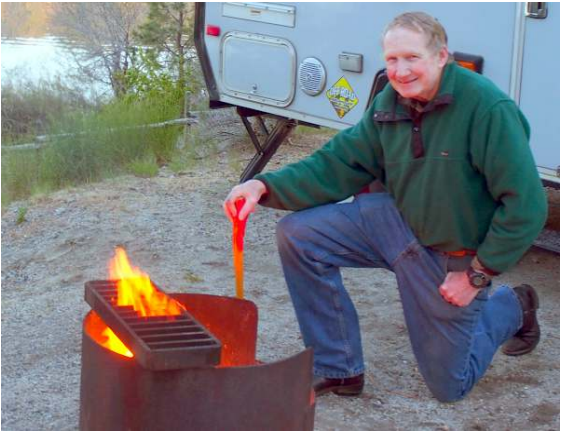
An evening campfire