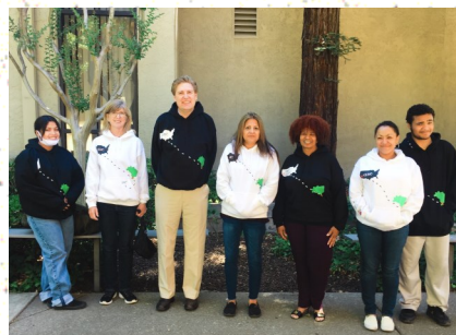
Team from Quail Lakes Baptist Church