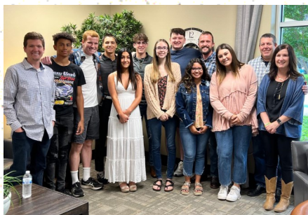
Team from Crosspoint Church

The housemothers felt so special for the simple fact of sharing meals with the Americans and Canadians who visited them. Two especially expressed how loved this made them feel and all had a wonderful time. And so did our children! They really value people from different countries and cultures coming here to interact with them and share God's love.