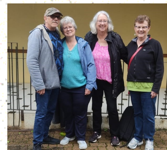
Team from Steele Heights Baptist Church

CHAIN OF LOVE HOMES, CP 2040, NOVO HAMBURGO, RS 93.511-970, BRAZIL chainoflovehomes@gmail.com www.larcolmeia.com.br