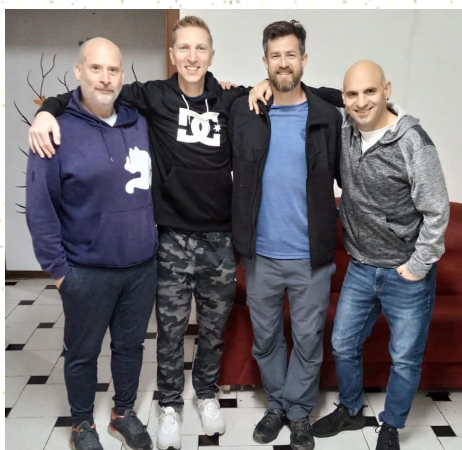
The Canadian team

( chainoflove.canada@gmail.com ) if you live in Canada for more information. It would be a pleasure and honor to have you